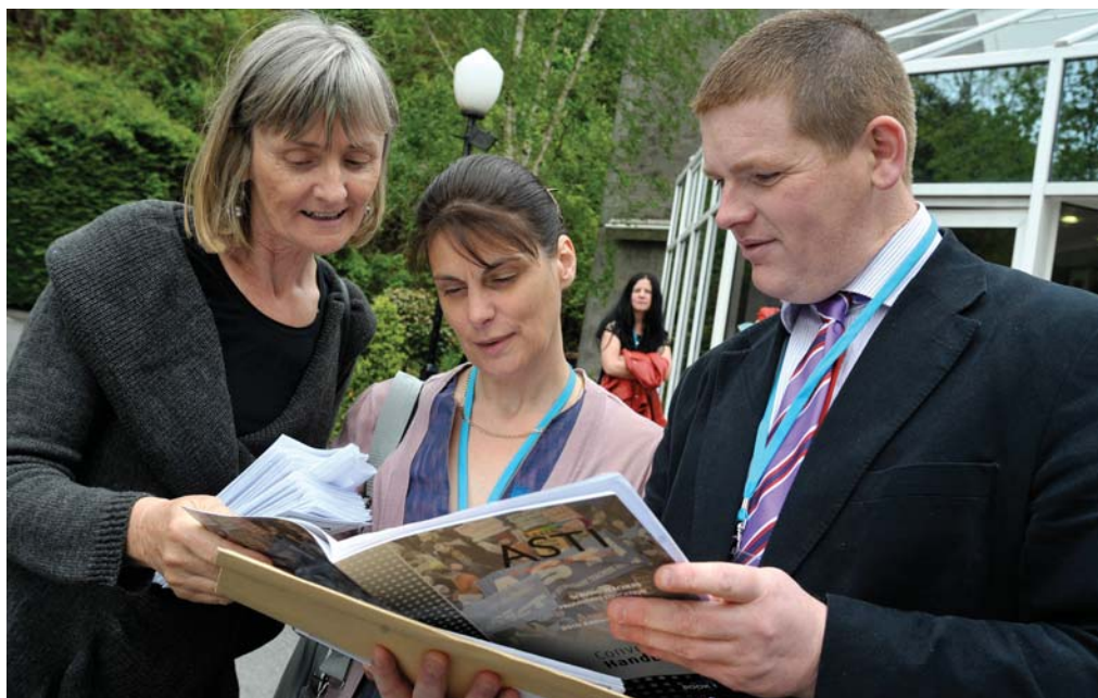
Sligo delegates discuss the agenda at ASTI Convention 2011.