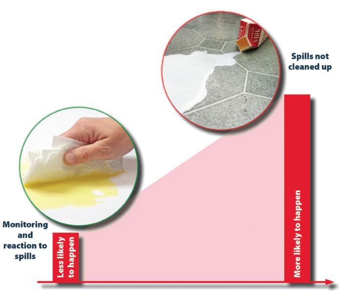
Increasing LIKELIHOOD that someone will be hurt

The following diagram shows how working unsafely increases the chance that someone will be harmed.