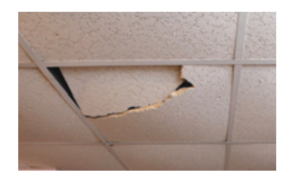
Left: The ceiling of the school's former changing room. The room has become unusable due to the extent of the dampness and mould.